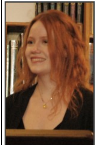
"I have lots of friends who

Seattle author Richelle Mead was spotted at Borderlands Books in San Francisco promoting the recent release of Succubus Dreams.